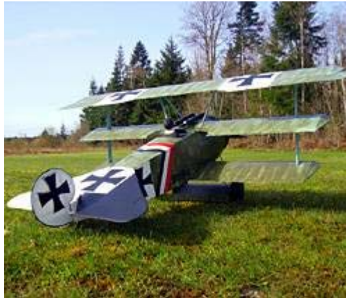
New design, Fokker Dr.1 46.7" at http://www.aerodromerc.com/

All jazzed up & ready for flying eh! Don't blame ya I think we have all been cooped up too long. It's time to roll out those old standby's and fresh new projects onto the tarmac! (or grass, in our case).