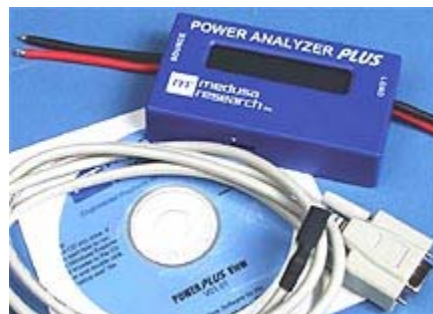
Medusa Power Analyzer II data Logger @ http://www.hobby-lobby.com/bataccy.htm

This little beauty can monitor all, motor, servo and can be ordered with USB